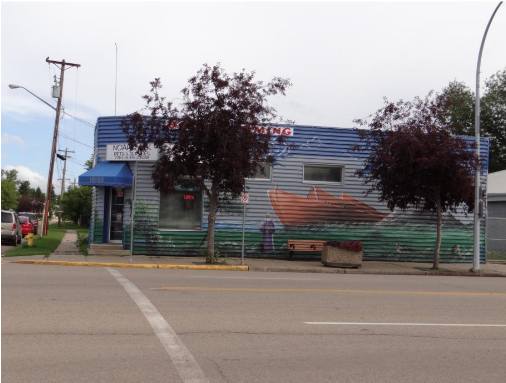
Filename DSC00897.jpg View South Side Date July 24, 2012