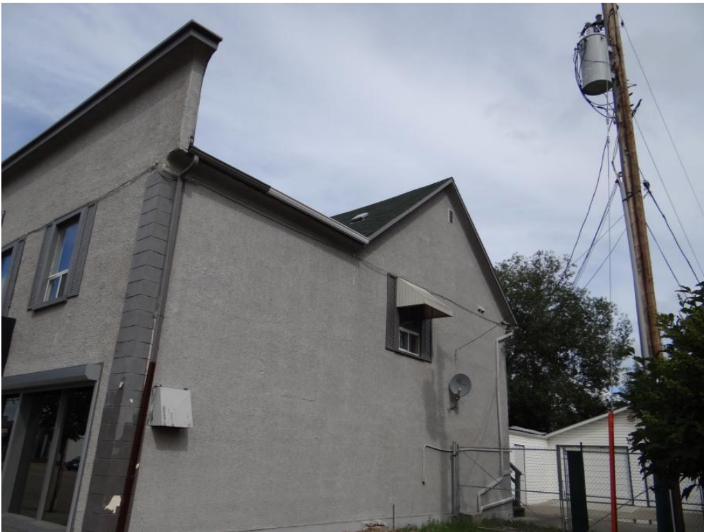
Filename DSC00908.jpg View SE Corner Date July 24, 2012