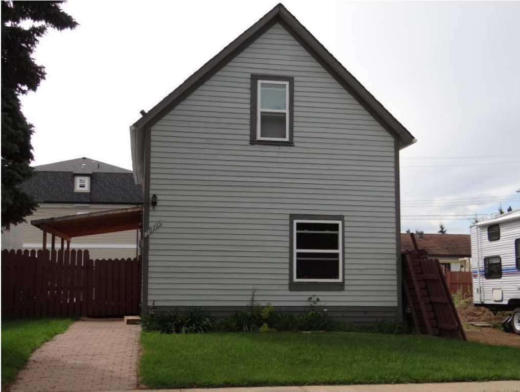
Filename DSC00927.jpg View North Side Date July 24, 2012