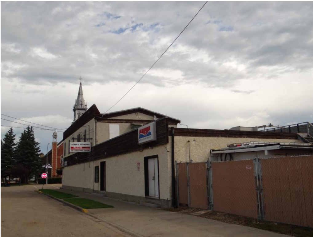
Filename DSC00824.jpg View SW Corner Date July 23, 2012