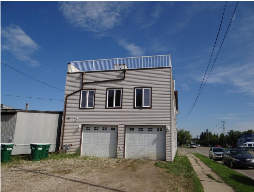
Filename DSC00725.jpg View South Side Date July 18, 2012