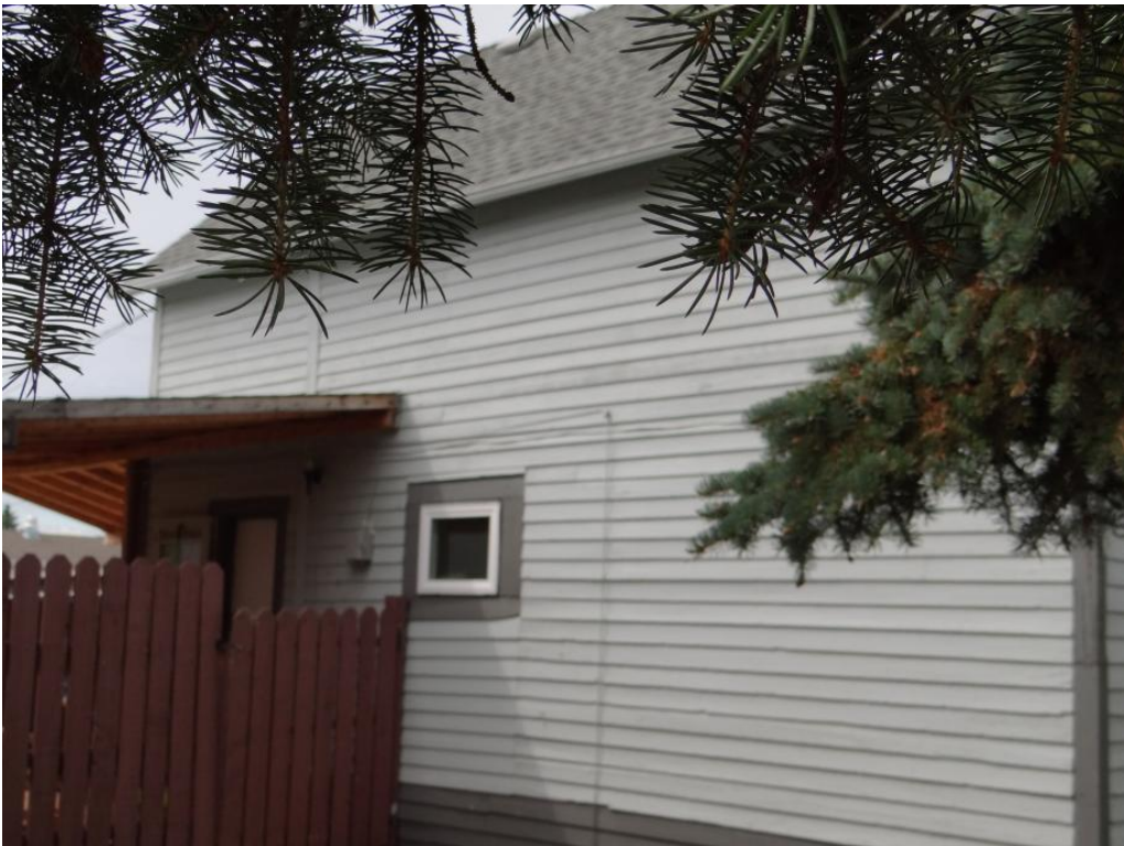
Filename DSC00928.jpg View East Side Date July 24, 2012