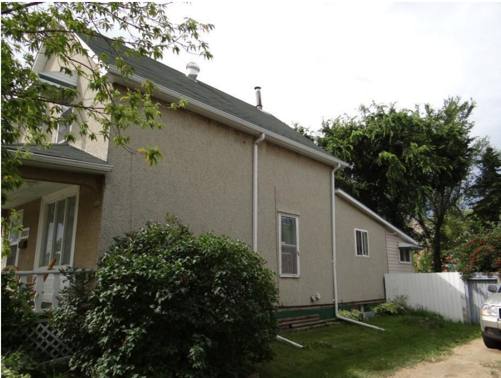
Filename DSC00842.jpg View NE Corner Date July 23, 2012