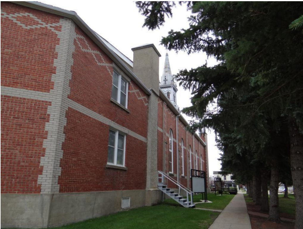
Filename DSC00887.jpg View NW Corner Date July 24, 2012