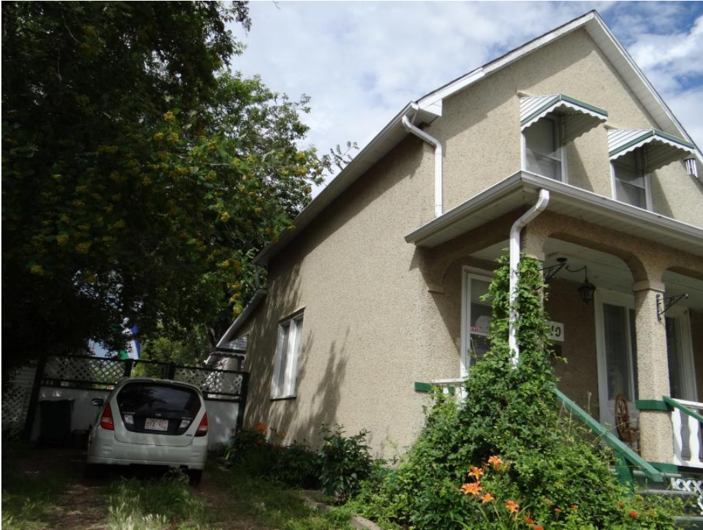
Filename DSC00843.jpg View SE Corner Date July 23, 2012