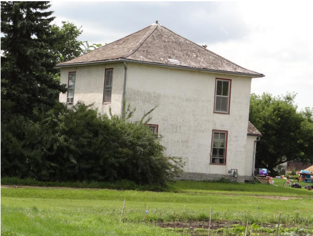
Filename DSC00992.jpg View NE Corner Date July 25, 2012