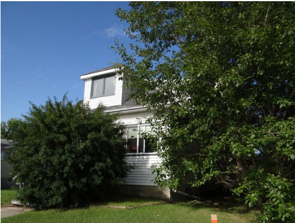
Filename DSC00724.jpg View NE Corner Date July 18, 2012