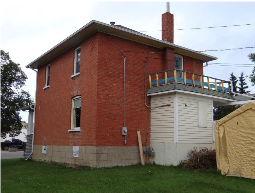
Filename DSC00865.jpg View NE Corner Date July 23, 2012