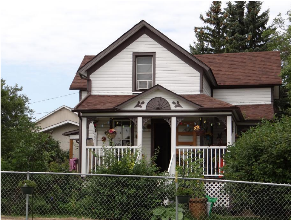
Filename DSC00983.jpg View East Side Date July 25, 2012