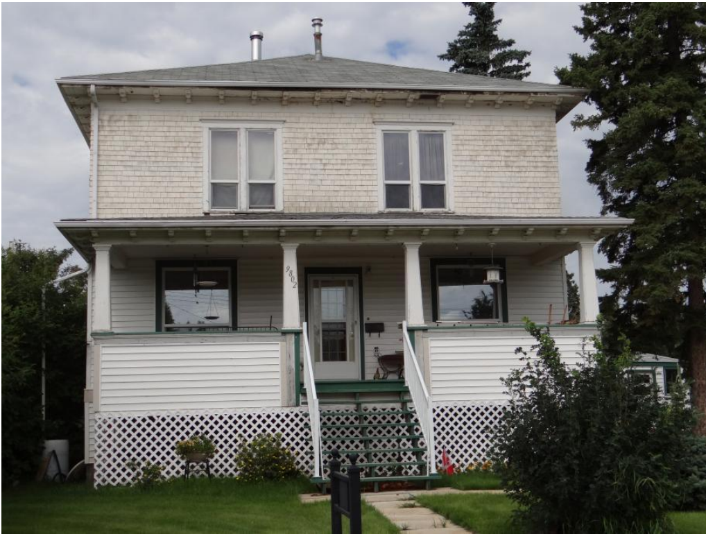
Filename DSC00968.jpg View East Side Date July 25, 2012