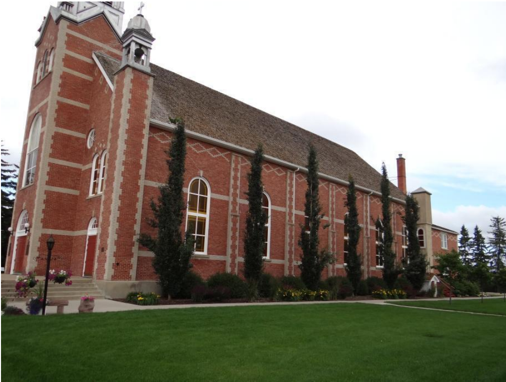
Filename DSC00882.jpg View SE Corner Date July 24, 2012