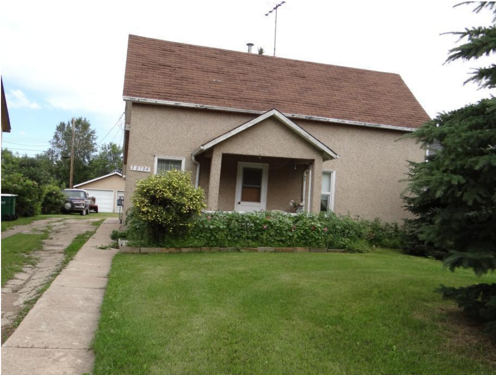
Filename DSC00917.jpg View South Side Date July 24, 2012