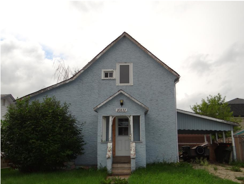
Filename DSC00923.jpg View North Side Date July 24, 2012