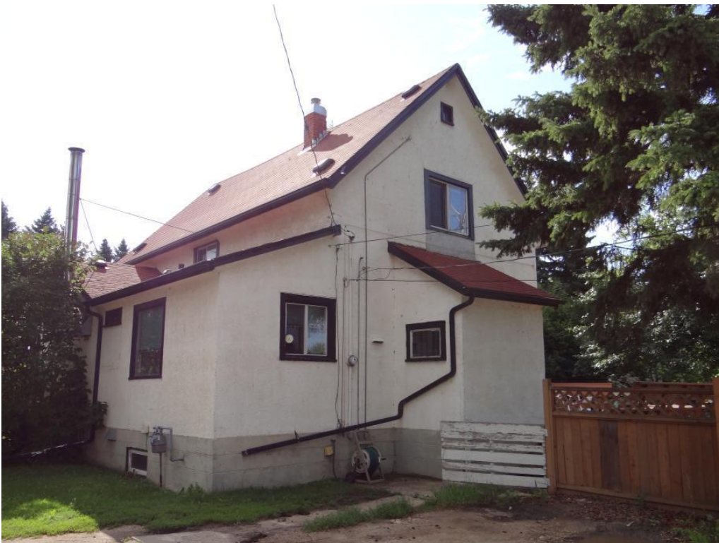
Filename DSC00959.jpg View NW Corner Date July 25, 2012