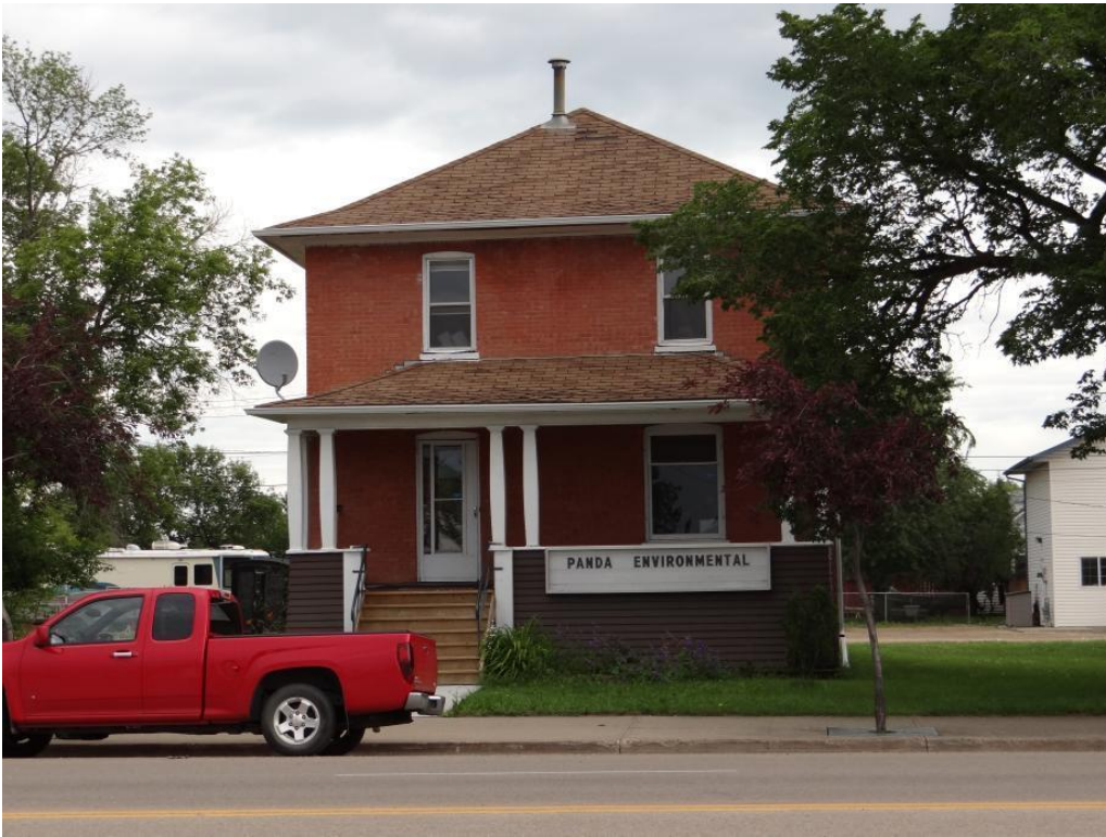
Filename DSC00862.jpg View South Side Date July 23, 2012