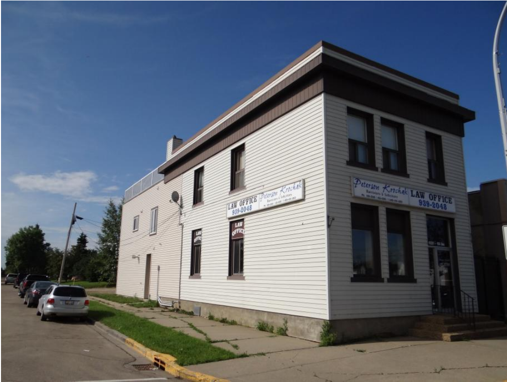
Filename DSC00730.jpg View NE Corner Date July 18, 2012