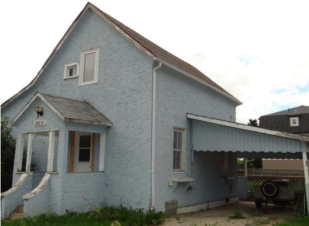
Filename DSC00924.jpg View NW Corner Date July 24, 2012