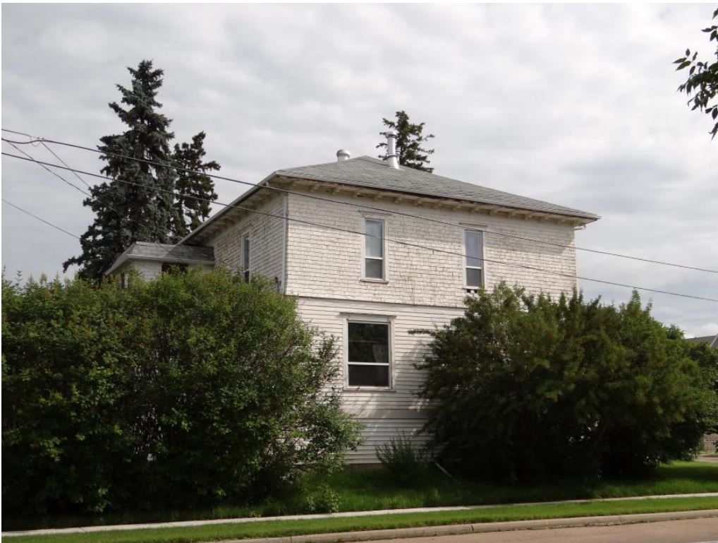
Filename DSC00966.jpg View SW Corner Date July 25, 2012