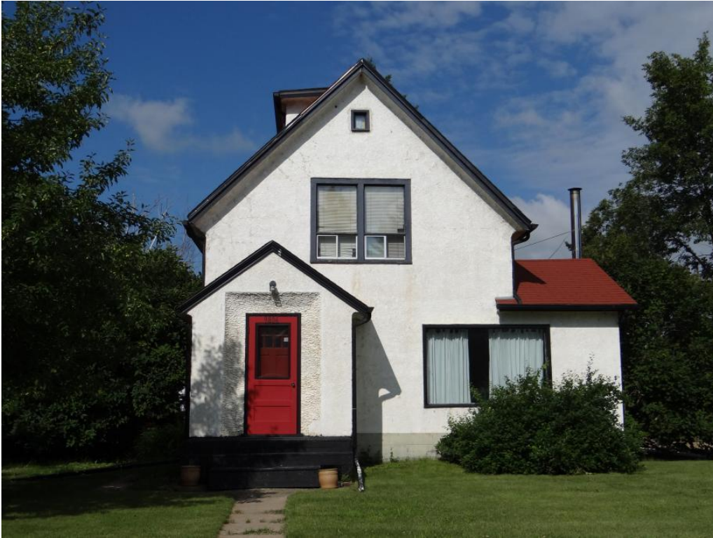
Filename DSC00955.jpg View East Side Date July 25, 2012