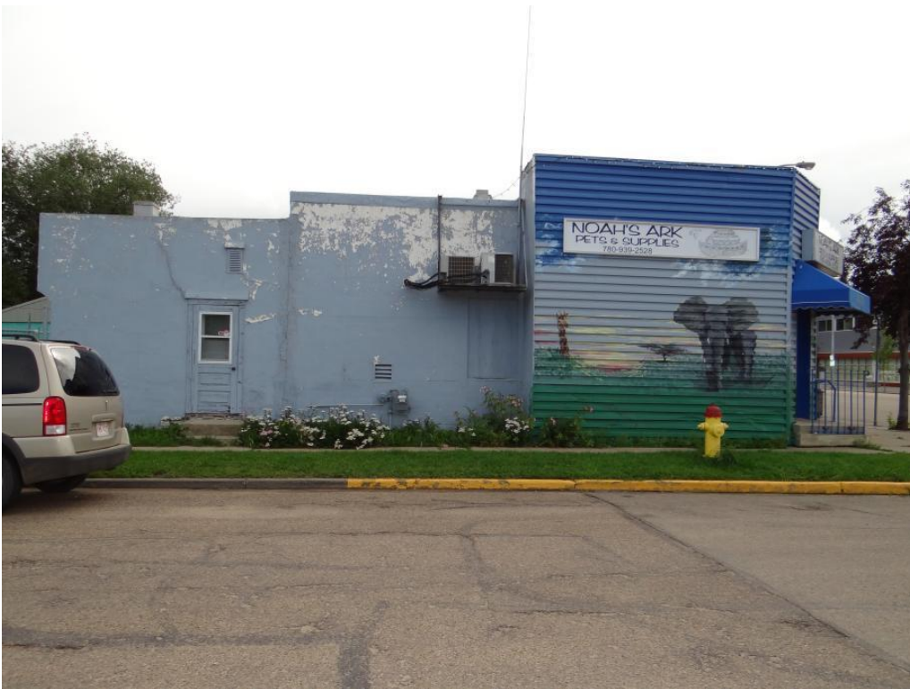
Filename DSC00899.jpg View West Side Date July 24, 2012