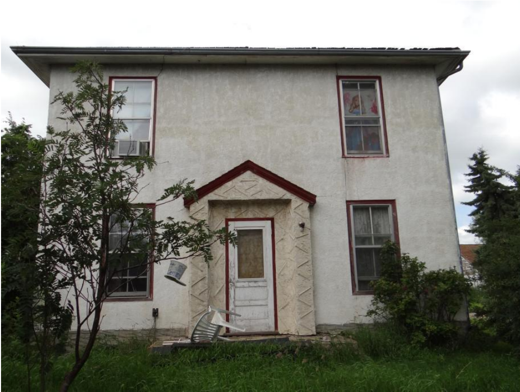
Filename DSC00995.jpg View East Side Date July 25, 2012