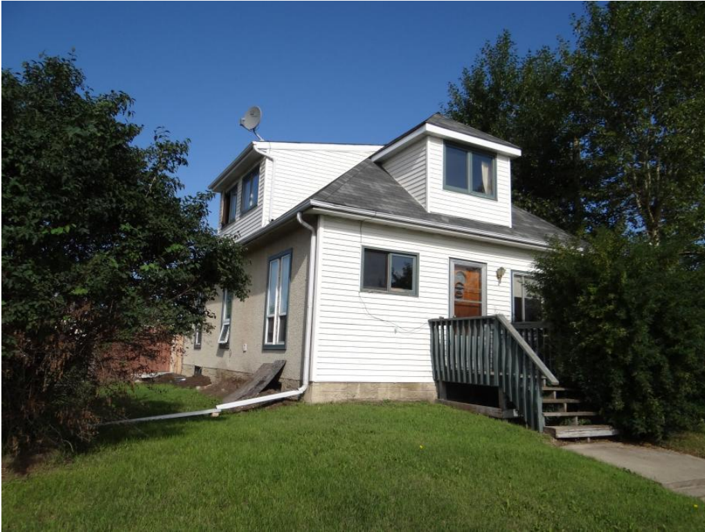
Filename DSC00722.jpg View SE Corner Date July 18, 2012