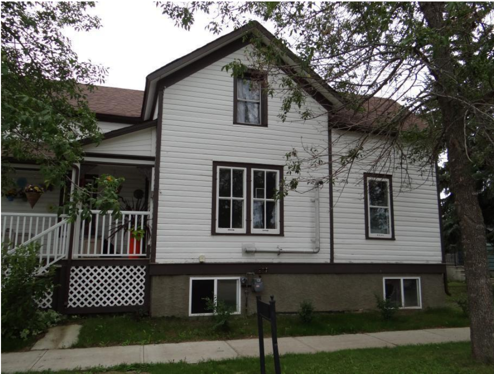
Filename DSC00981.jpg View North Side Date July 25, 2012