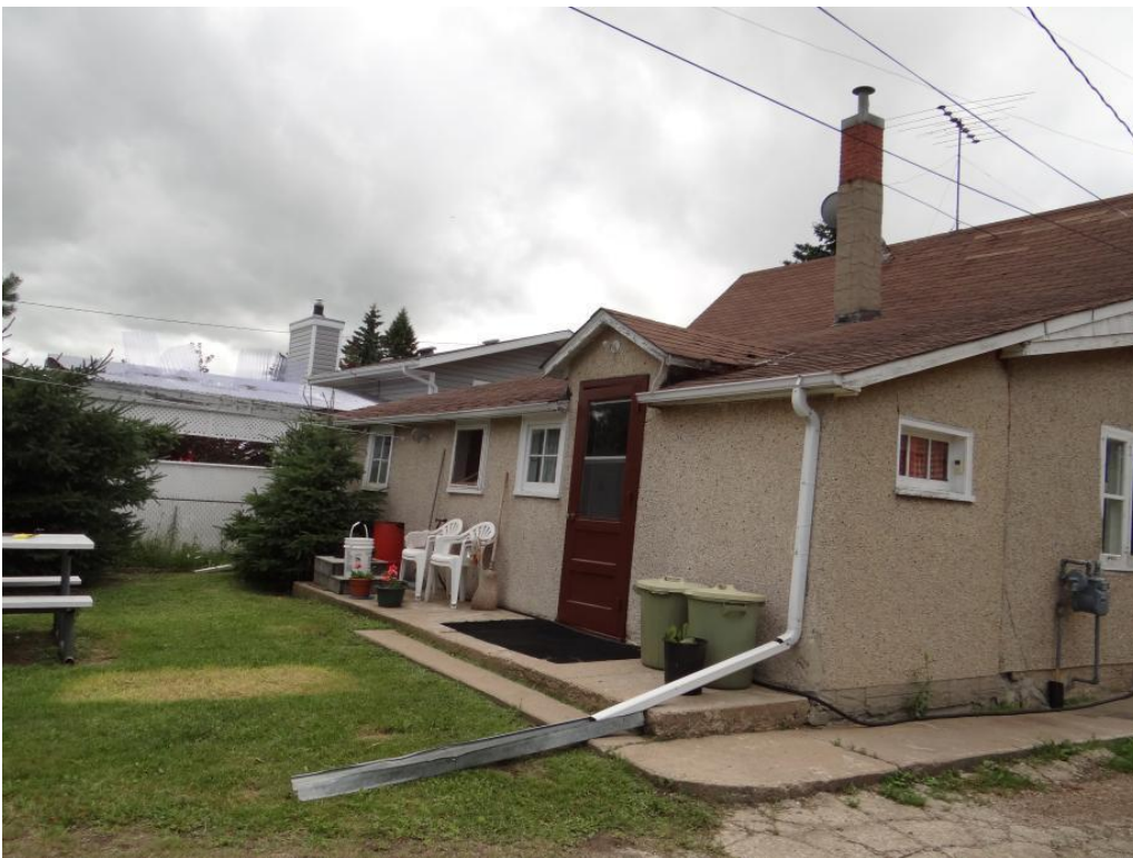
Filename DSC00919.jpg View NW Corner Date July 24, 2012