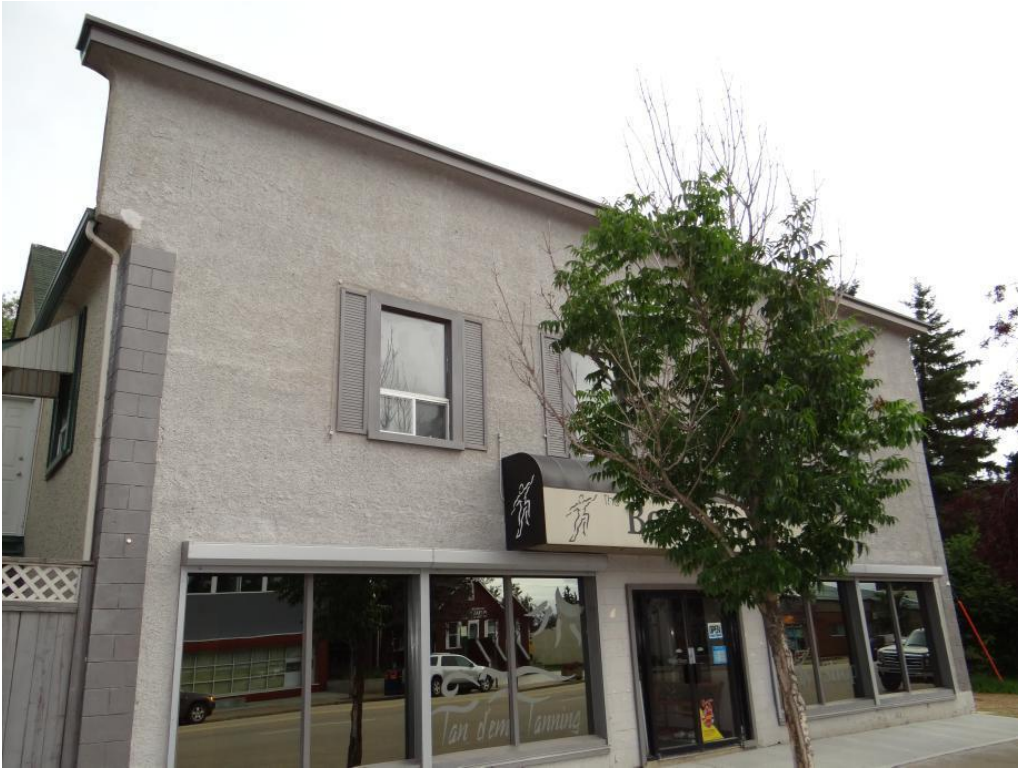
Filename DSC00907.jpg View SW Corner Date July 24, 2012