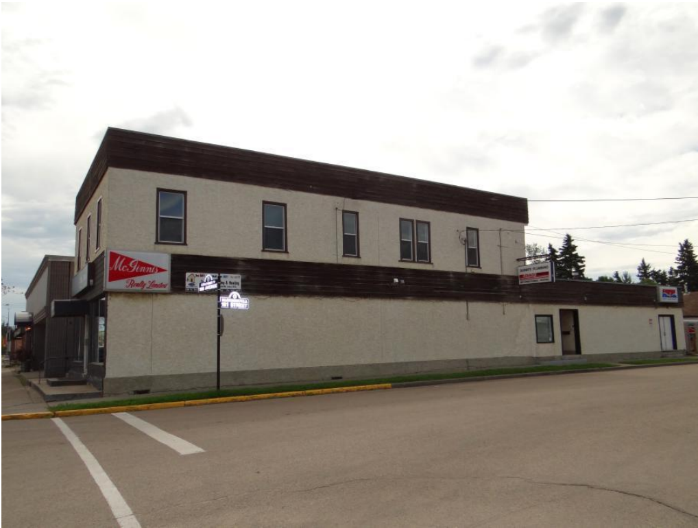
Filename DSC00823.jpg View NW Corner Date July 23, 2012